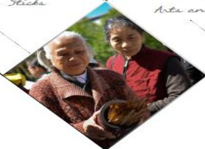
Taiwanese Arts and Crafts